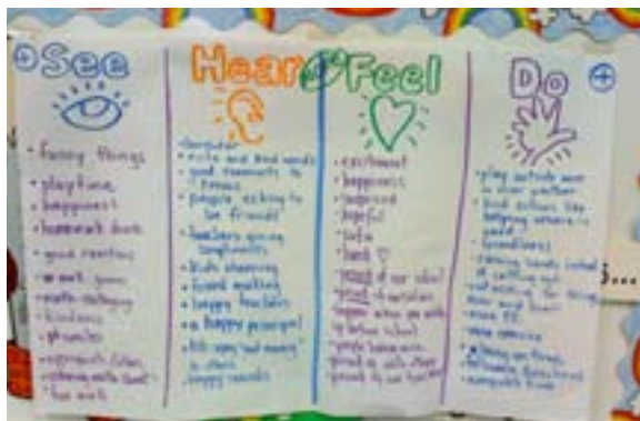
Chart courtesy of PAX GBG® http://goodbehaviorgame.org .

years and there are over 20 independent replications of the game. In a review of 22 studies, the Good Behavior Game was found to have a moderate to large effect on challenging classroom behavior and other school related behavior (Flower et al., McKenna, Bunuan, Muething, & Vega Jr, 2014). In another review of 21 studies, the overall effect of the Good Behavior Game was considered to be significantly large ( ES = .82 ), which resulted in a significant decrease of problem behaviors and an increase of appropriate behaviors (Bowman-Perrott et al., 2015). Furthermore, past studies have shown that the effects on challenging behavior are immediate and significant (Flower et al., 2014). The Good Behavior Game has been found to be easy to implement, require minimal extra effort or preparation from the teacher, be cost and time effective, accessible for all teachers in all countries, and most importantly, it is proven to work well to reduce behavior problems in the classroom (Elswick & Casey, 2011). Specifically, the Good Behavior Game is effective in increasing on-task behavior and reducing disruptive behavior (Lannie & McCurdy, 2007). As well as effectively increasing instructional time by spending less time dealing with problem behavior (Flower et al., 2014).